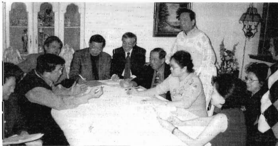
Organizing Committee At Work