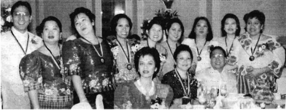
Silver Jubilarian Class 1975 in their native attire at the EDSA Shangri-La reception.