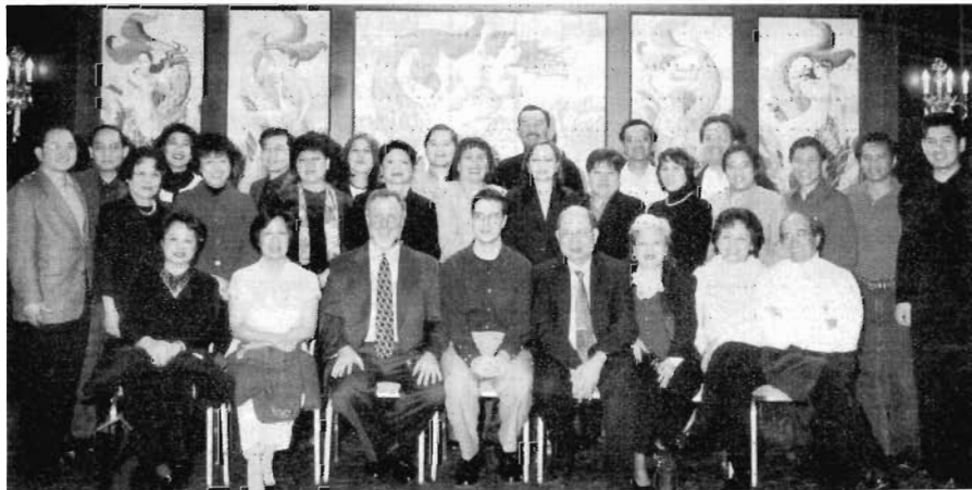
Northeast Chapter members and guests at the conclusion of the brief CME program on asthma the morning after their fundraiser dinner-dance at the Renaissance Westchester Hotel, White Plains, NY on March 3, 2001.