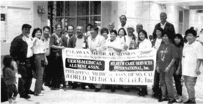
Southern California Medical Mission Team upon arrival at NAIA, Manila.