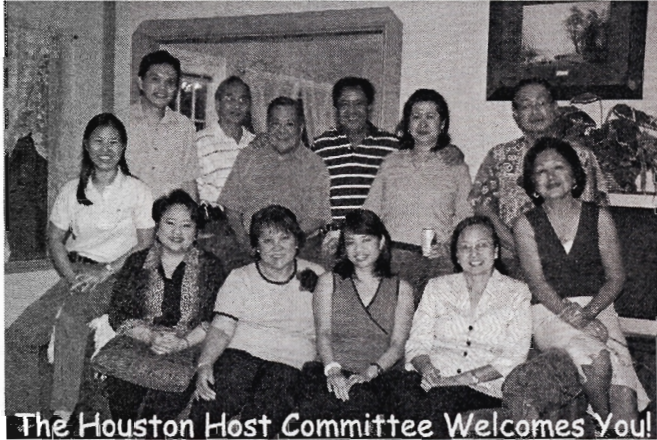
The Houston Host Committee Welcomes You!